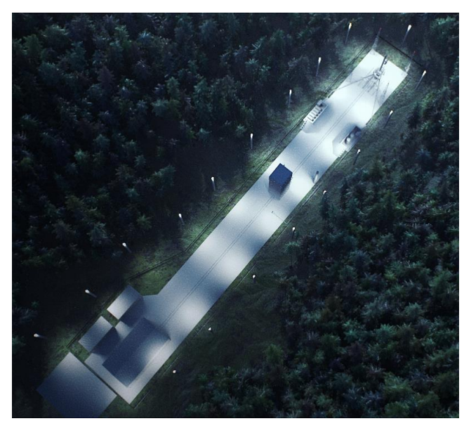
Figure 2 Launch Complex East; Reusability testing and Orbital launch