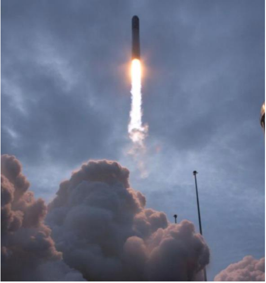
Figure 5 Test launch of micro launcher

Starting from 2019, SSC Esrange is open for suborbital testing of small satellite launch vehicles, a campaign is already booked for 2020.