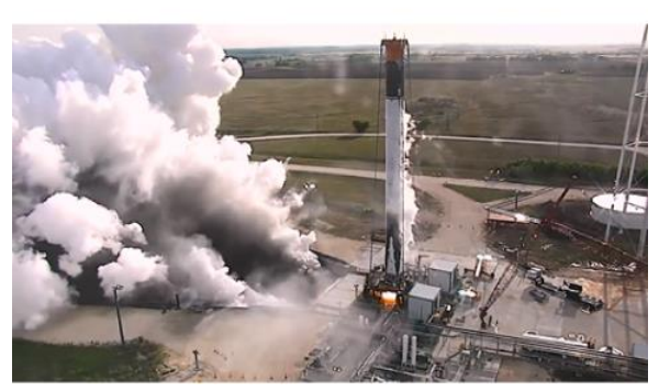
Figure 4 SpaceX stage testing of Falcon 9 booster

whole small satellite launch vehicle stages without going overseas for performing the tests.