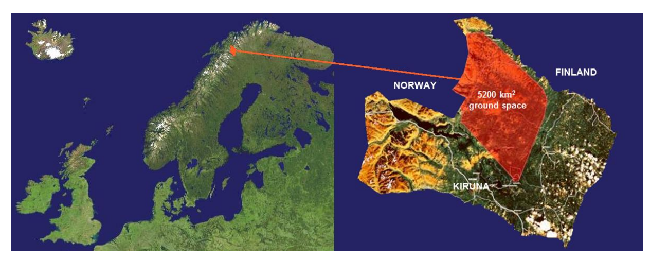
Figure 1 Esrange impact area

Esrange also hosts one of the world's largest civilian satellite ground stations, a hub in SSC's global satellite ground station network, SSC Universal Space Network.