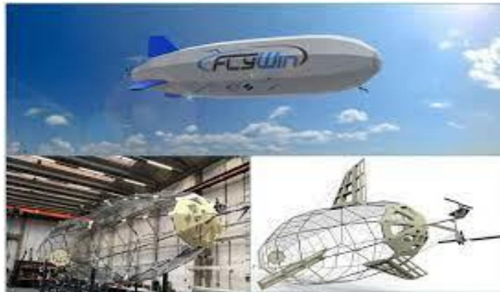
Illustration 2: FlyWin, 2019-The Flywin carrier demonstrator, above envisioned the 2 nd prototype, left below the first demonstrator, right below back end view of the rigid frame of the first demonstrator, Flywin 2019.

The hydrogen LTA concept suits the Remotely-Piloted-Aircraft-System (RPAS) configuration: having no pilot on board is ultimately safer. Ground staff can operate remotely during all operations: pre-flight checking, take-off, landing, and cruising flights. These aspects ensure satisfactory safety conditions for the ground crew. Otherwise, onboard intelligence and algorithms are better suited to manage cruising flight and ground operations than human management.