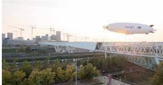
Illustration 5: Hylight Demonstrator on one of the first Demonstration Flights, Hylight 2022.

An even more recent initiative in Europe is the Hylight Aero carrier. This is also an initiative for a surveillance carrier, in the end with the objective as well to develop a carrier for monitoring of energy infrastructure [20] . The company has also developed a first demonstrator that has flown in Italy and in France. The end objective of this carrier is also to use hydrogen as a lifting gas. See also illustration 5 for a picture of the first demonstrator.