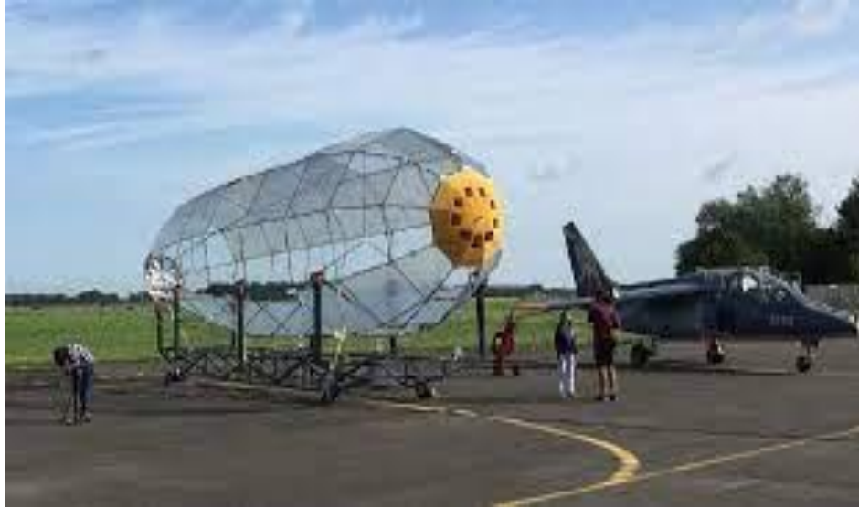
Illustration 1: The first FlyWin Demonstrator at a Floating Test in Beauvechain, Belgium, Flywin, 2019.

scaling up, the flight ambitions will certainly increase. FlyWin's final aim is a North Atlantic cruising flight for the serial phase. This new context will define new future technical requirements.