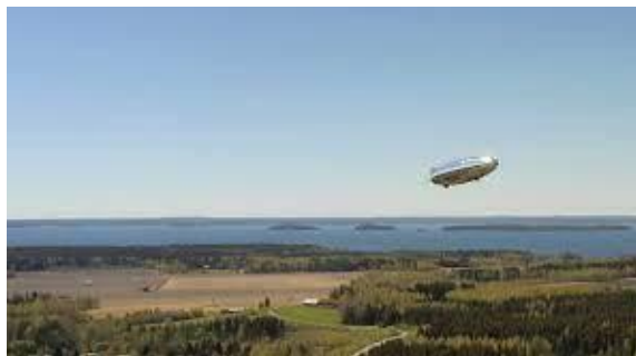
Illustration 3, Demonstration flight, Kelluu, 2022.

In 2018 start-up Kelluu [19] was founded in Finland. The Kelluu airship is designed for aerial monitoring of, amongst others, energy infrastructure. It is an LTA unmanned U-LTA carrier, using hydrogen as a lifting gas and in a fuel cell for its electric propulsion. Since that time, it has successfully developed its practice and has already commercial operations in Finland.