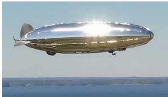
Illustration 4. Close-up photo of the Kelluu carrier

The Finnish authorities have granted a permit to fly for its operations. It did not seem that Kelluu had met many challenges in obtaining the permit for the development of their carrier. Since 2019 they have already flown their carrier for a number of years in different climatological conditions, both the in Finnish summer as well as in the winter period.